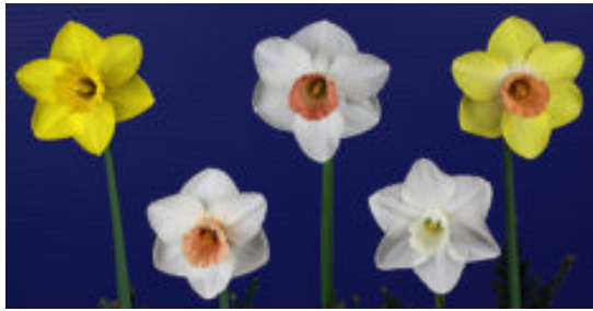
Red-White-Blue Ribbon Winner and Purple Ribbon Winner exhibited by Kirby Fong

The Purple Ribbon is for the best collection of 5 standard daffodils in the show. The Red-White-Blue Ribbon is for the best collection of 5 standard daffodils originated in America. Flowers in the winning collection are: Back: 'Chicago Gold' 1Y-Y (Reed), 'Pink Silk' 1W-P (Havens), Reed 2003-32-5 2W-P; Front: 'Commodore Perry' 1W-GPP, 'Louise Randall' 2W-W (Reed).