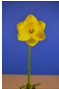
Best Intermediate 3 Stems, exhibited by Clay Higgins Skilliwidden 2Y-Y