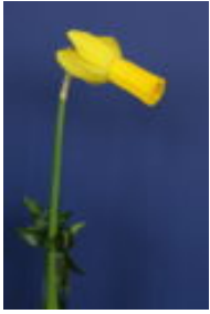
'Rapture' 6 Y-Y