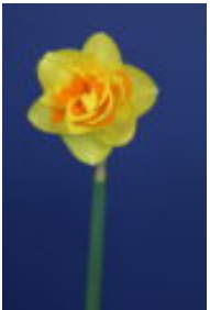
'Little Alice' 4 Y-O