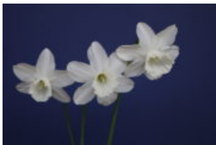
'Niveth' 5 W-W 1931