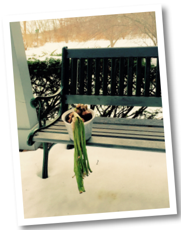
Daffodils in Chicago in early March

• The Indiana Daffodil Society Show will be in Indy on April 17-18 at Holliday Park. Minnesota's is May 15-17.