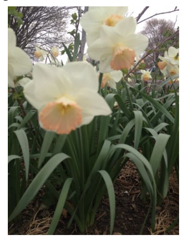
What pink was planted at U of I Extn Office some years ago?

• Did you notice the two different logos at the top of the pages? Which should we use?