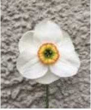
Poets Day 9-GYR. I bought the stock of Poets Day in 2018. It failed to bloom until 2021 after I moved it to the back 40 daffodil beds. Now that it is a proven bloomer it is being offered for the 1 st time.