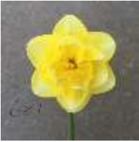
Lemon Flounce – Breed and Grown in 2020 by Nial Watson. It is seed fertile.