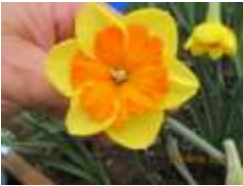
Slit Atom 11a Y-O. A very popular Div 11. Wins many Blue ribbons. It is both seed and pollen fertile.