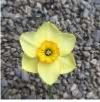
Green Eyed Beauty – One of the best Nial Watson introductions. A big show winner in Northern Ireland. It is both seed and pollen fertile. 1 st year to be offered.