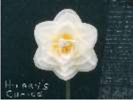
Hilary's Choice 4W-O. One of the best Nial Watson introductions. It must be great if you name it after your spouse. If you like very symmetrical Division 4's this one is for you. 1 st Time offered for sale. It is pollen fertile.